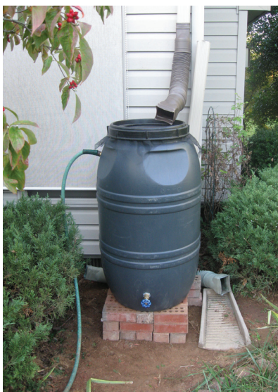
Figure 1. Fifty-five gallon rain barrel made from a recycled olive barrel. A plastic downspout extension is used to direct water into the barrel.

A rain barrel is placed under a gutter's downspout next to a house, small shed or other outdoor structure to collect rain water from the roof. The water can then be used in various ways including to water a garden. A rain barrel provides two important environmental functions: 1) harvesting rain water provides an alternative to utilizing the drinking water supply for gardening and other uses, and 2) the overflow from a rain barrel can be directed to a pervious area (an area where rain water can infiltrate into the ground) such as a lawn or garden and help replenish ground water supplies. By collecting rain water, homeowners help to reduce flooding and pollution in local streams, rivers, and lakes. When rain water runs off of hard surfaces (also called stormwater) like rooftops, roadways, parking lots, and compacted lawns, it carries with it pollution to the storm drain system and is then discharged directly to our rivers and lakes. Often in older cities, the storm drain system is combined with the sanitary system. During large rain events the storm water and raw sewage is discharged directly to local waterways. Harvesting rain water in a rain barrel reduces the potential for stormwater to deliver pollution to our local waterways.