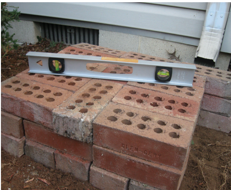
Figure 2. Brick platform used to elevate a rain barrel. The ground below the platform should be leveled out before installing a rain barrel.

Installing a rain barrel under a downspout is simple but does require some planning. Determine beforehand where the overflow from your barrel will be directed. Consider how the downspout runoff conditions will change when you install your barrel. For example, many downspouts are directed below ground through a stand-pipe, and the roof runoff is discharged to some distant runoff area such as the street. If installing a rain barrel in this situation, determine beforehand whether the overflow will go back into the standpipe or whether you can safely divert the water to a landscaped area and allow some to soak into the ground. Ideally the overflow should be directed to a pervious area where the water can infiltrate into the ground, such as a garden, mulched planting bed, or lawn. This is not always possible especially in more urban, highly developed areas. When it is possible to direct the overflow to a pervious area, overflow should be directed at least six (6) feet from the house or building foundation if there is a basement and at least two (2) feet if there is a crawl space.